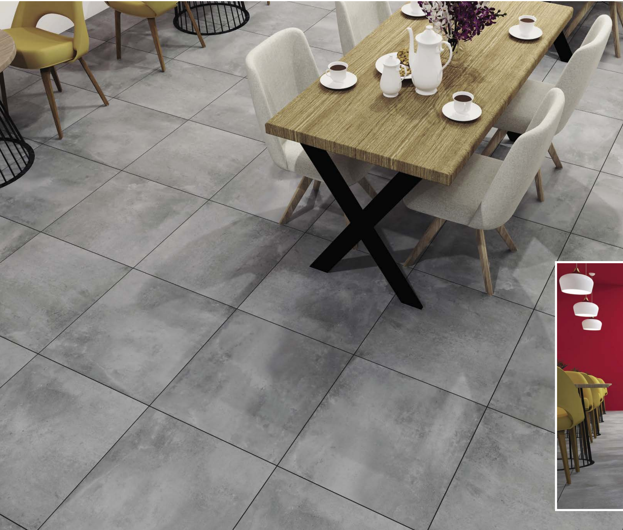
FLOOR: PNZ03 Iron - 60x60cm - matt