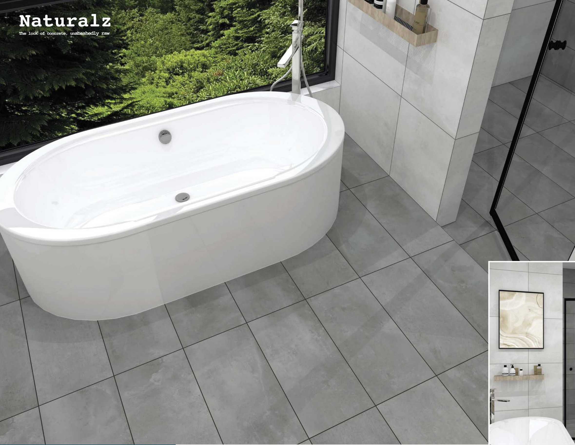
WALL: PNZ01 Silver . 60x60cm . matt | FLOOR: PNZ03 Iron . 30x60cm . structured